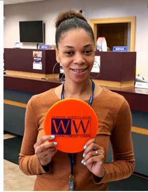
Member Service Representative showing off our foam frisbees.