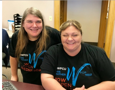
Two of our tellers showing off our new shirts.