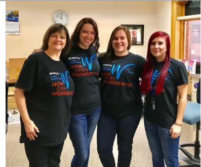
The drive-thru team celebrating our first Wonderful Wednesday.