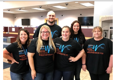
Our team in their new shirts. (Blonde lady in front designed them!)